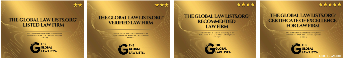
Listed Law Firm